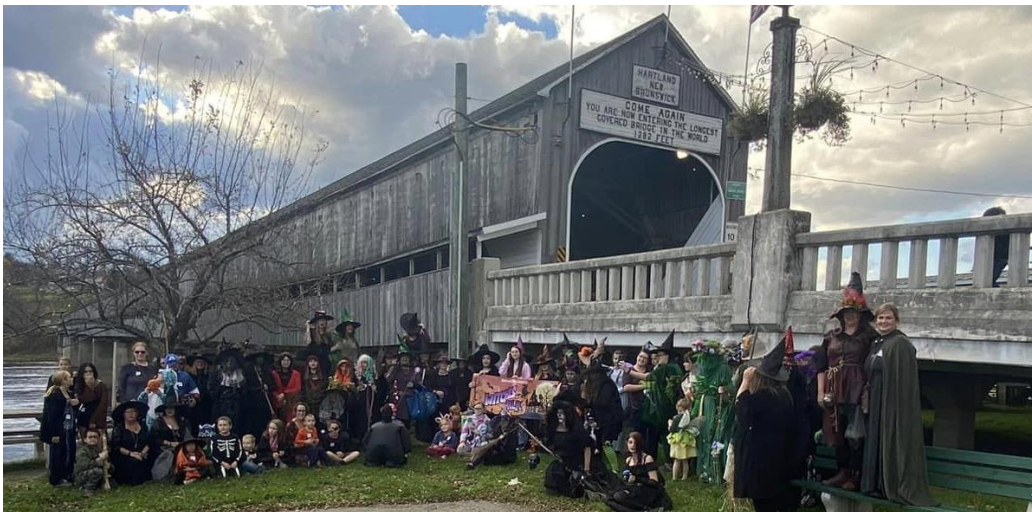
Photo of 2023 Witch's Walk participants

For more information on how to donate or get involved, visit the Hartland Helpers' Facebook page. Your support makes all the difference. www.facebook.com/hartlandhelpers